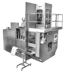
Rommelag® Bottelpack 460